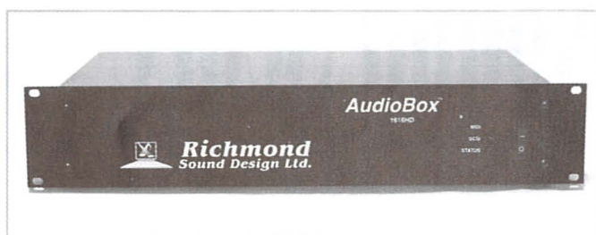
Typical asynchronous multi-track hard disk playback unit: the Audio Box by Richmond Sound Design.

MiniDisc systems are currently in use in many theatres across the country. If a de facto standard has arrived for a piece of sound playback gear, the MiniDisc might be it. Why then do so many people seem to be embarrassed to admit that they use it? The reason for the somewhat seedy reputation of MiniDisc systems comes from the way it digitally encodes audio. The MiniDisc compresses standard 16-bit digital information into 8-bits using a compression scheme called Adaptive Transform Acoustic Coding (ATRAC). Dave Tosti-Lane summarized the controversy over the audio quality of MiniDiscs: "MiniDisc is a pretty remarkable piece of equipment. We all know what we're supposed to think about the MiniDisc. We all know we're supposed to think that it sounds like crap, and you could never use it because of