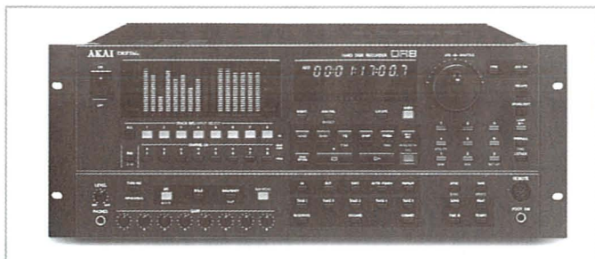
Typical multi-track hard disk playback unit: AKAI, model DR8.